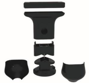
Exploded view of the new designed device.